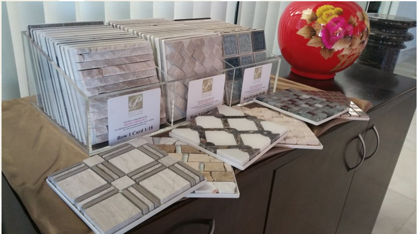
Table Top Display 20x10x7