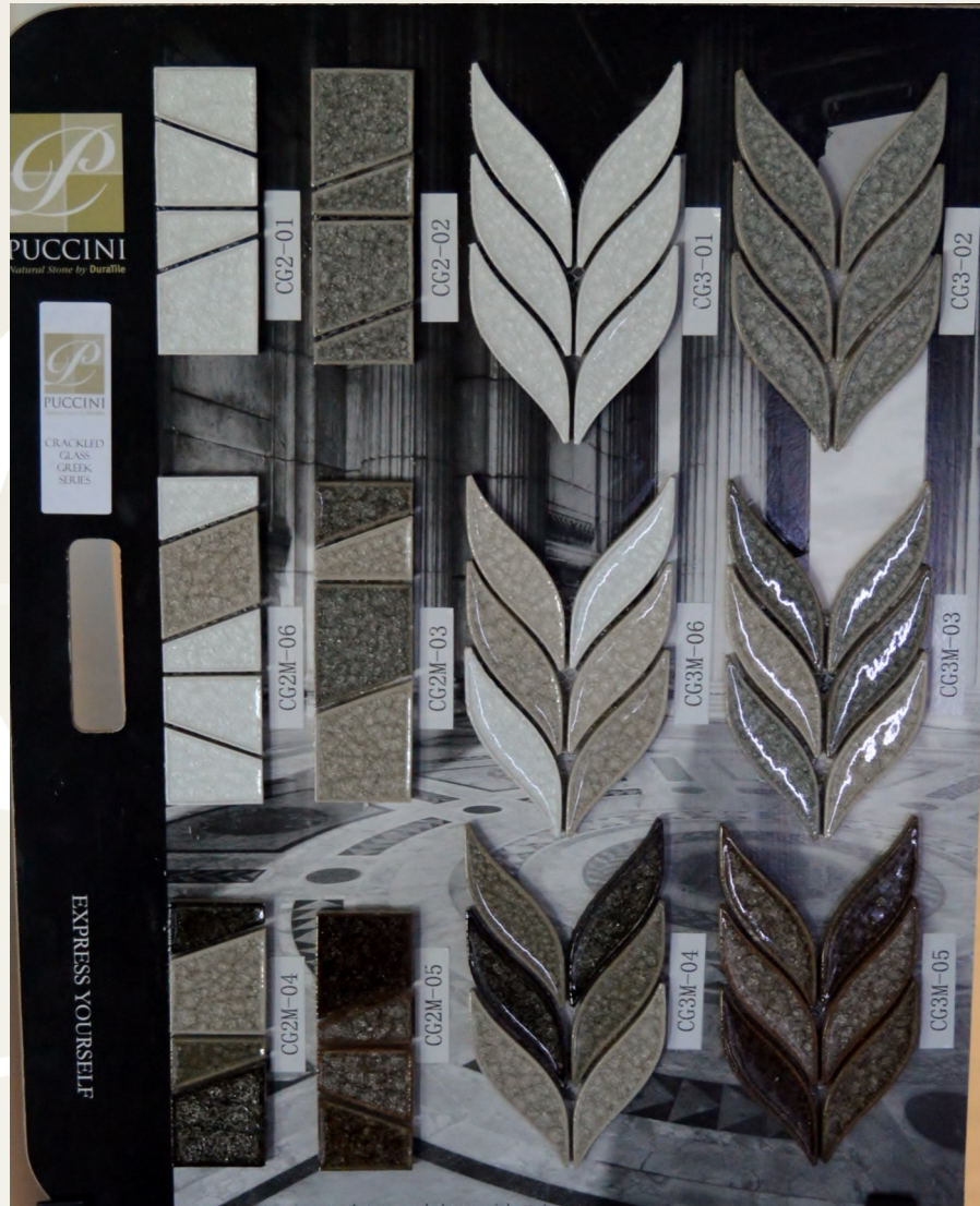
Custom Sample Board

One Piece from every Item in each Series.